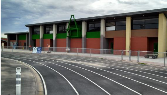
AHS New Stadium P.E. Bldg

Stadium Renovations: Finishing touches are being addressed for the opening game of the season on 9/12/13.