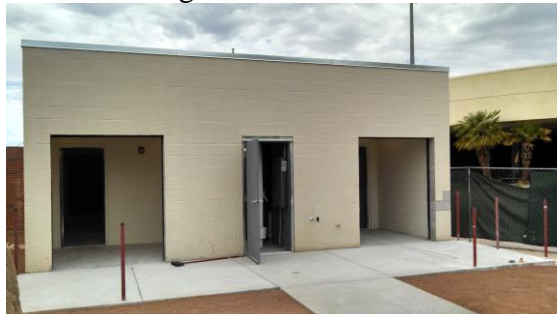
AHS New Café Restrooms

Café Restrooms: Fixtures are being set and final site work is under way