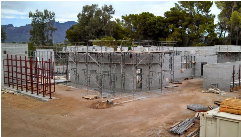
Rio Vista New Classroom Bldg. Exterior Masonry and Interior Framing

New Classroom Building exterior masonry is being completed and interior framing is in process.