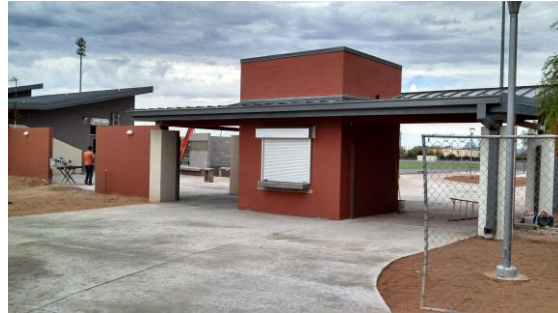
AHS New Stadium Ticket Booth / Entry