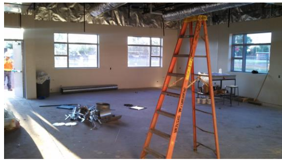
Holaway New Classroom Bldg. Interior