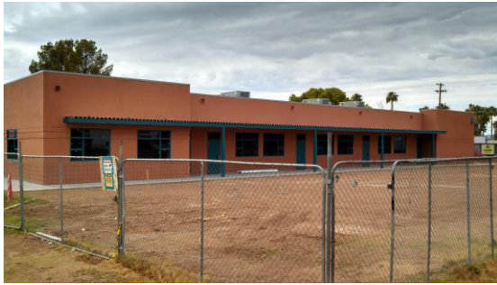
Holaway New Classroom Bldg. Exterior

New Classroom Building exterior finishes are in process. Interior finishes like ceiling grid and mechanical and electrical finishes are in process.